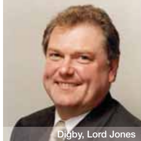
Digby, Lord Jones